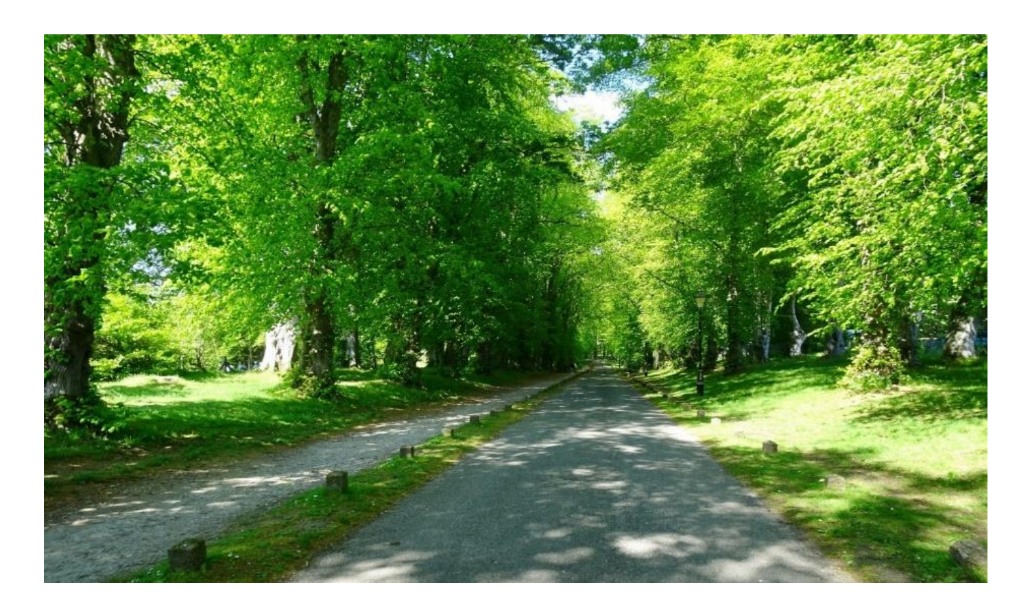
Head straight down here until you reach Huntly Castle, a great opportunity to take plenty of photos.